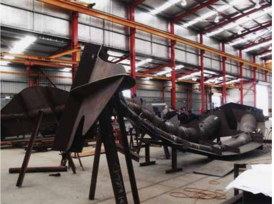
Construction of Northern Spirits at Sabre Engineering, Picton WA