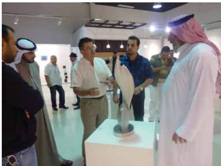
FOUR WALLS GALLERY DUBAI UAE CULTURAL EXCHANGE EXHIBITION 2013