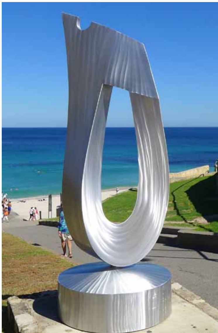
CYCLE OF LIFE – LIVING 2015 Marine Grade Aluminium 270 x 100 x 100cm Sculpture by the Sea Cottesloe 2015 Collection Town of Claremont