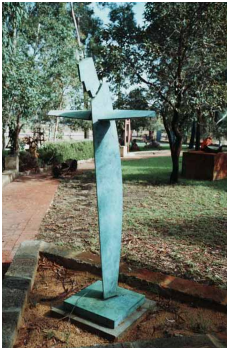
IN HIS SHADOW 2002 Copper