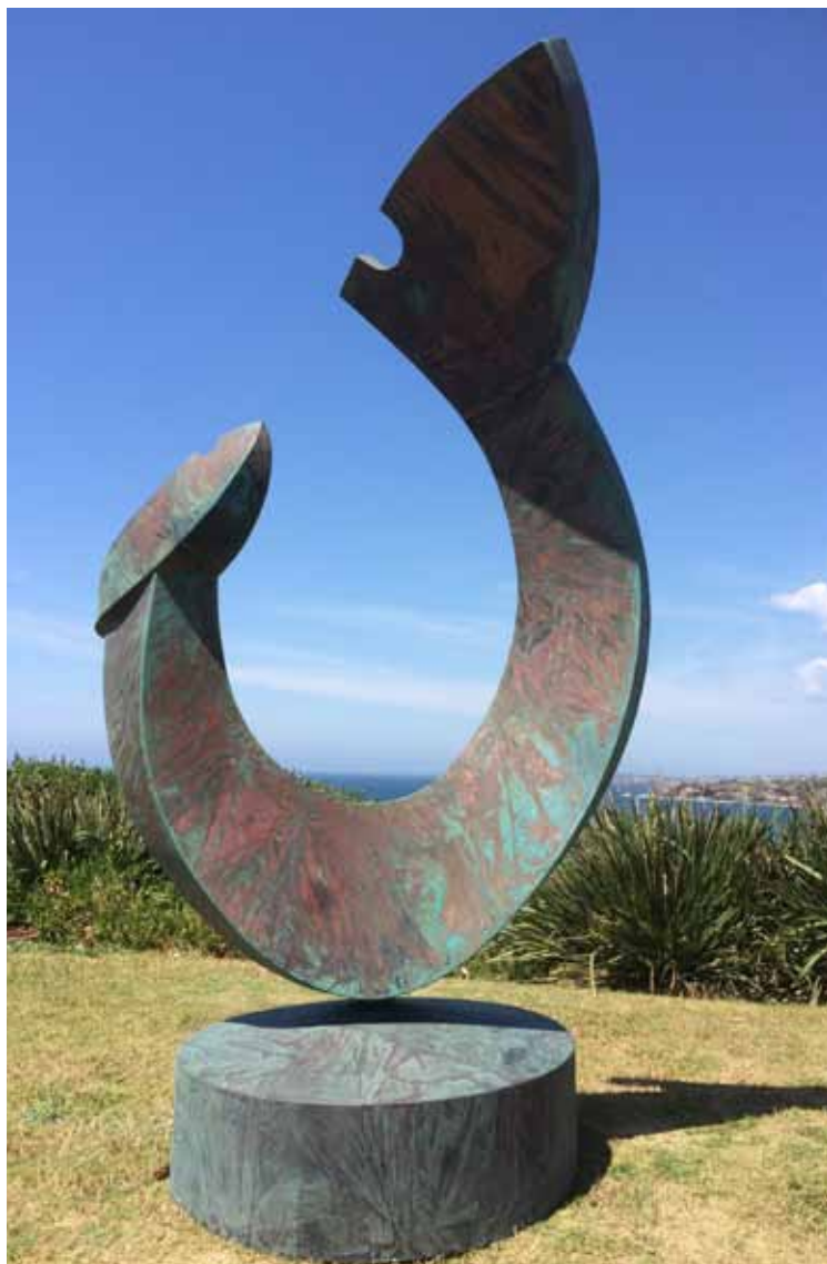
THE MOMENT 2014 Copper 270 X 155X155cm Sculpture by the Sea Bondi 2014 Private Collection NSW