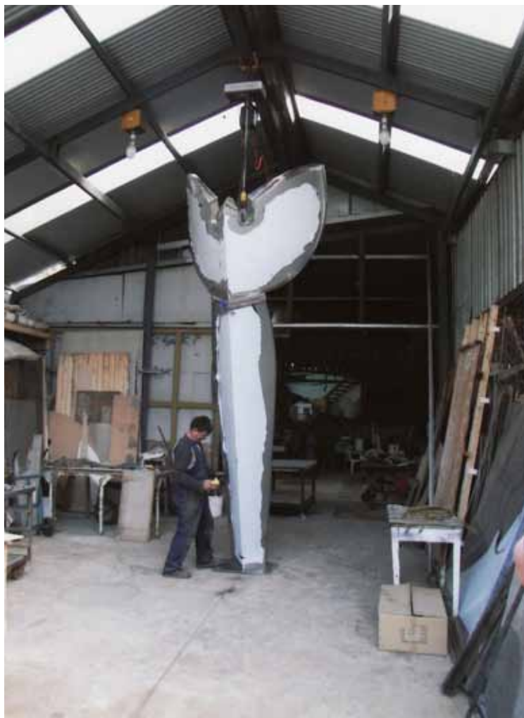
THE GUARDIAN 2009 Polished stainless steel 4.5 metres tall Work in progress.