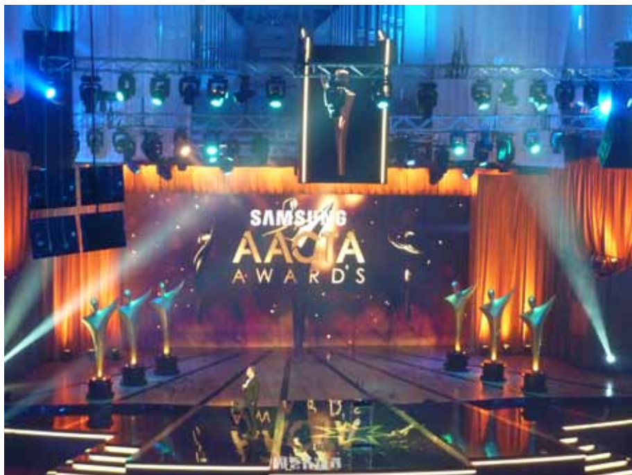
Inaugural presentation of the AACTA Awards At Sydney Opera House 31 January 2012