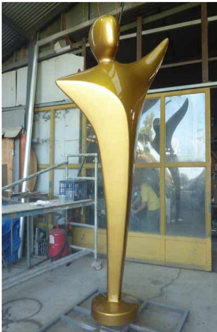
Working on large AACTA sculpture At the Gomboc Studio, Middle Swan