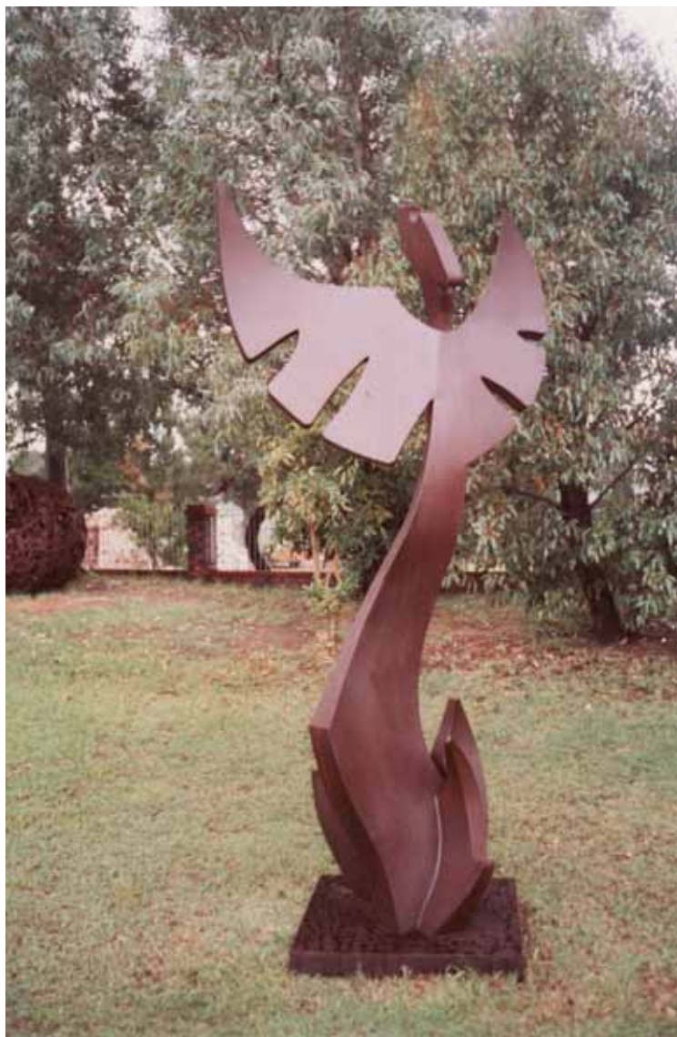
BIRD FORM 1987 Fabricated steel