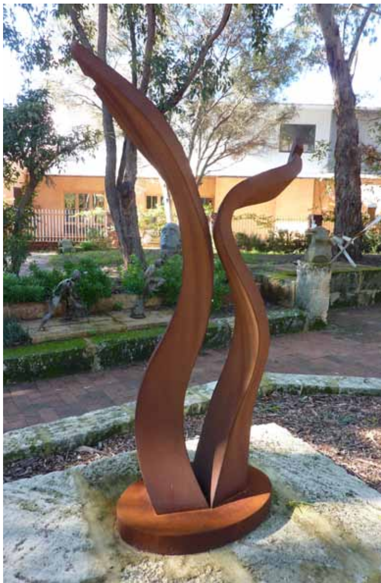
NORTHERN SPIRITS 2011 Commissioned by FMG for Chapel at Cloud Break Mine Pilbara, Western Australia