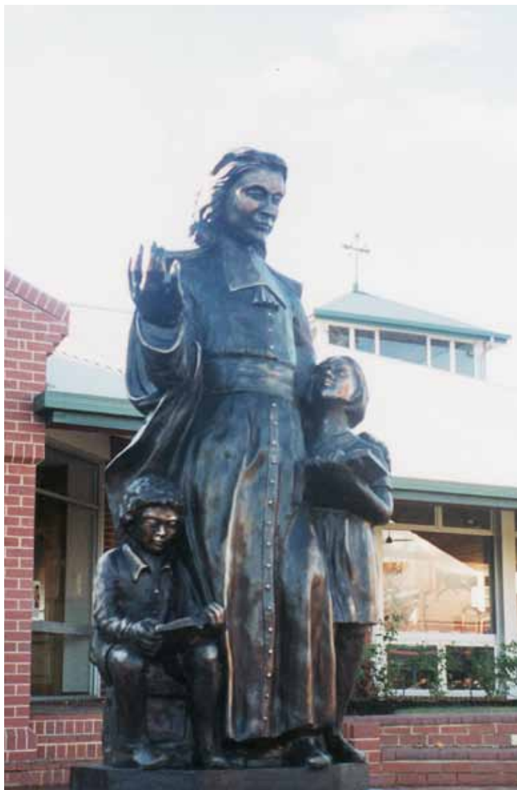
ST. JOHN BAPTISTE DE LA SALLE 2000