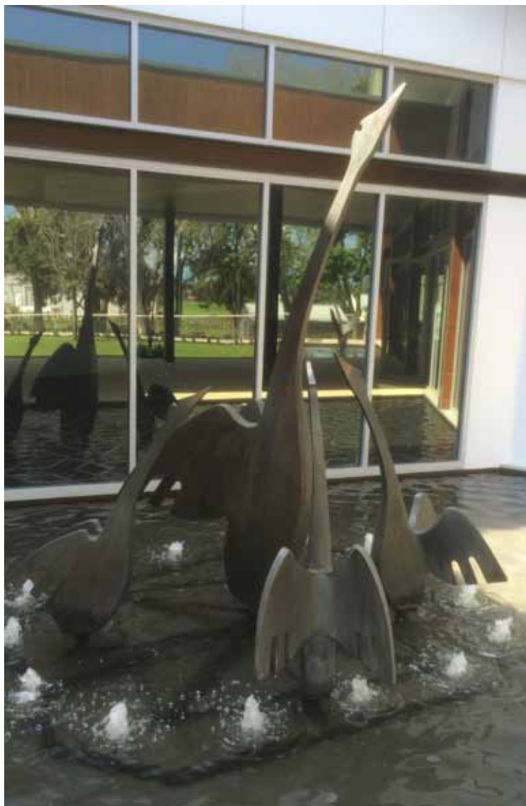
MANDOON ESTATE COMMISSION SWAN VALLEY, WA Copper Various Size (Four of Six sculptures Commission 2014)