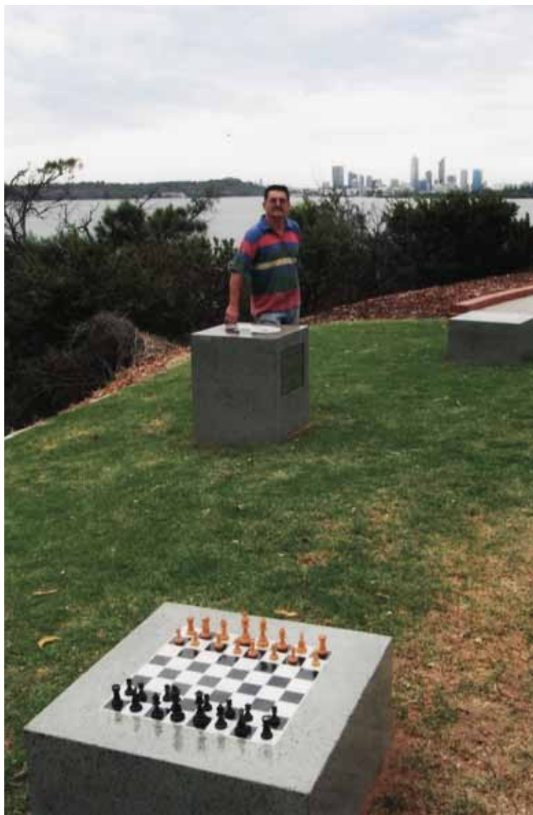
HEATH LEDGER MEMORIAL 2009 Commissioned by Ledger Family. Heathcote Applecross, City of Melville Collection.