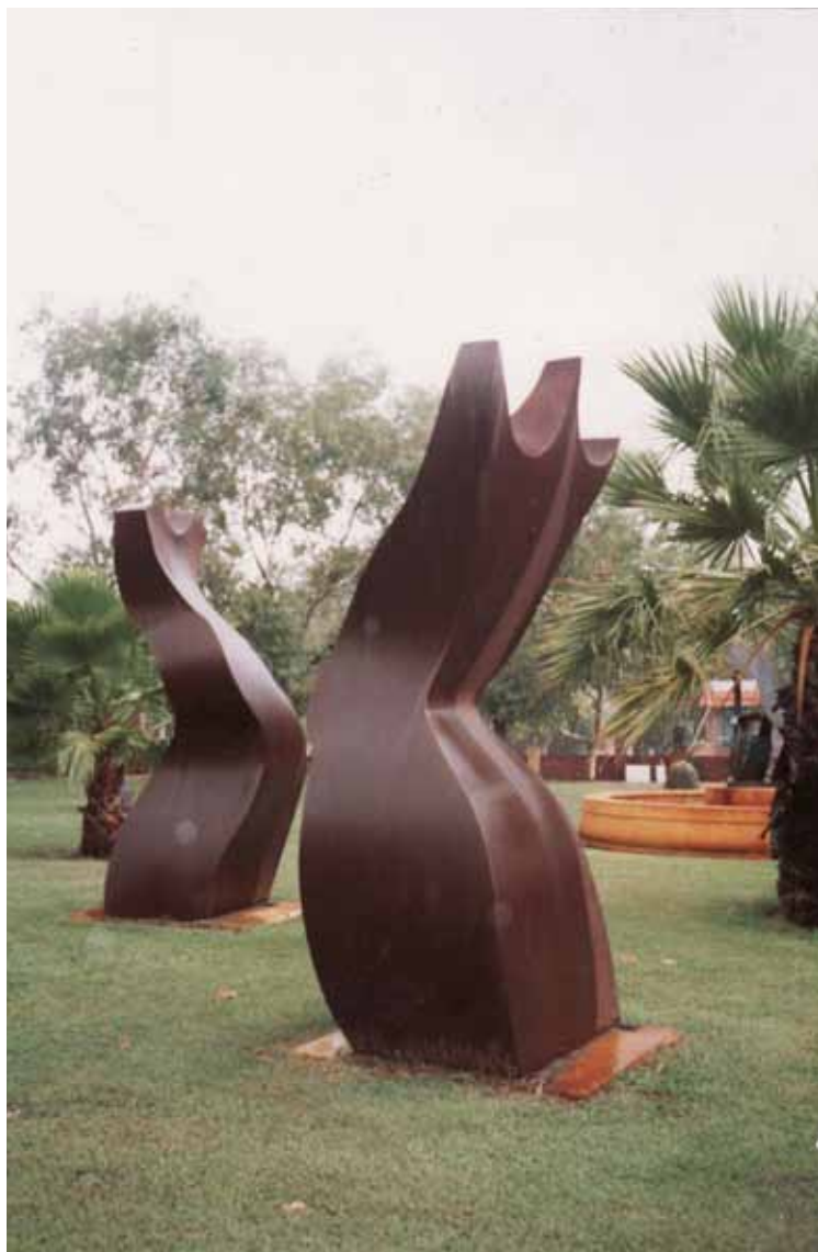
KING AND QUEEN 1987 Steel, 310 x 140 x 140 (each) Gomboc Gallery Sculpture Park..