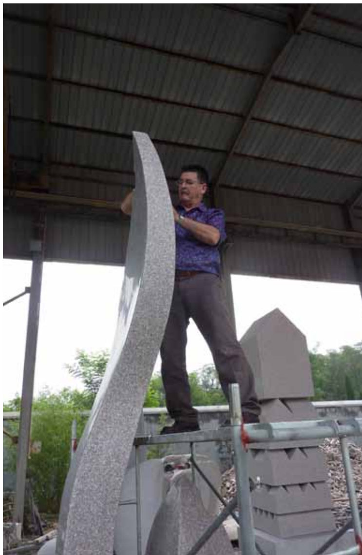
THE FIRST CHINA QINGDAO INTERNATIONAL SCULPTURE SYMPOSIUM 2012 Working on Pink Granite Mother and Child sculpture (Representing Australia)