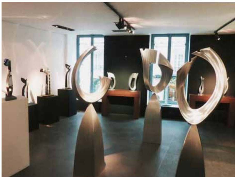
View of exhibition at Galerie Adler Paris, France 2010.