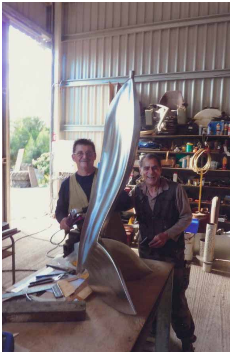
Melanesian Arts Festival 2010 Noumea, New Caledonia