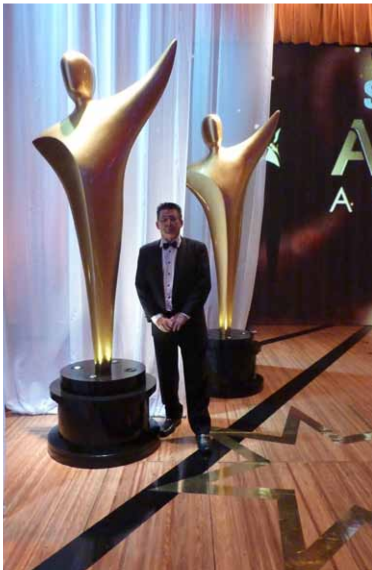
Inaugural AACTA Awards 31 January 2012 Sydney Opera House Stage