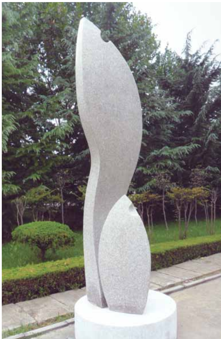
MOTHER AND CHILD, NEW LIFE-NEW BEGINNING 2012