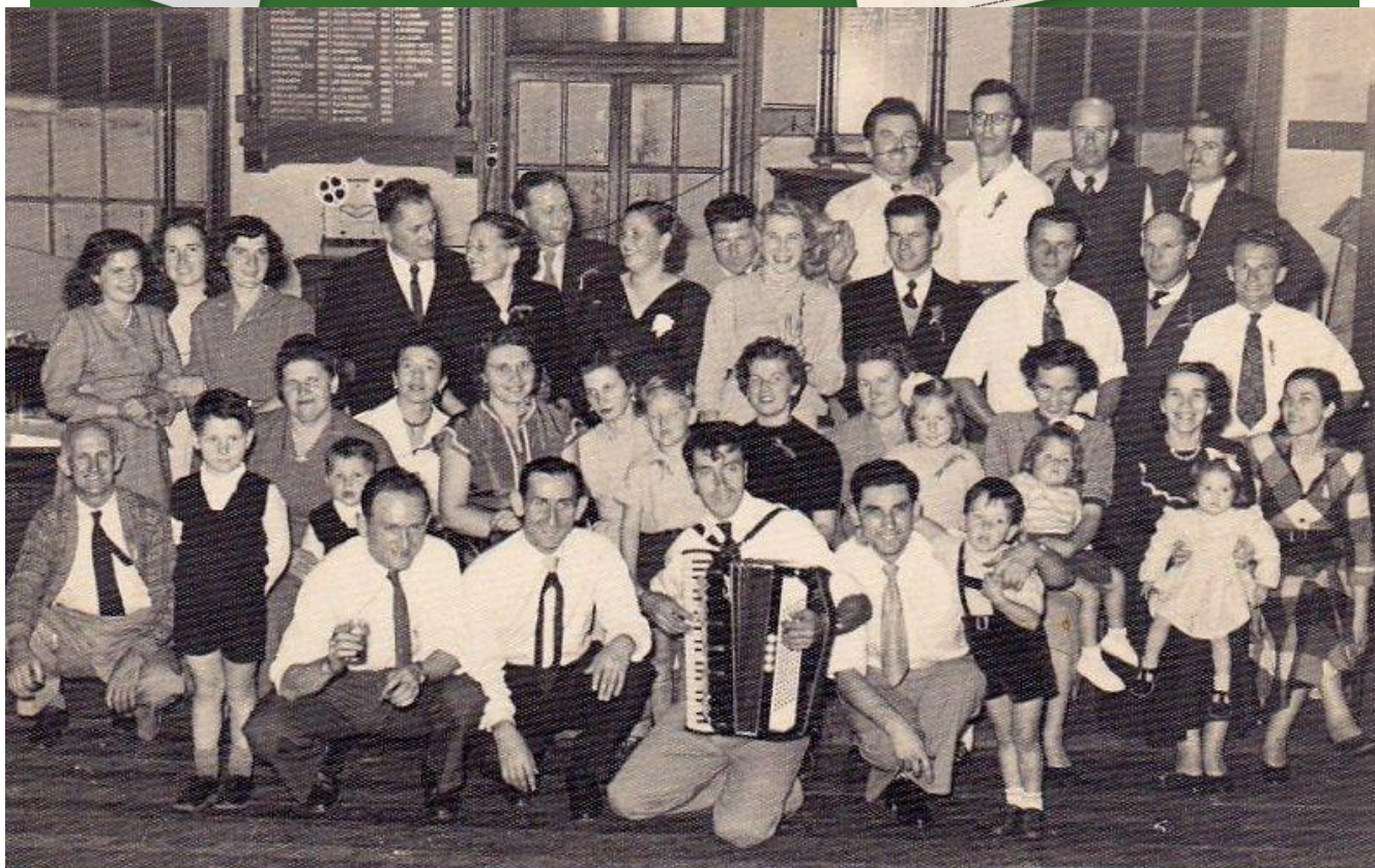
Prva slovenska zabava v BAFS dvorani - Brisbane - oktober 1954